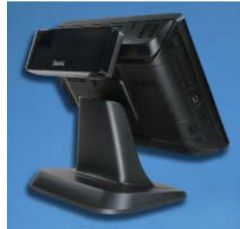
Optional Integrated VFD Customer Display