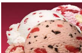
Bars / Ice Cream / Small Grocery