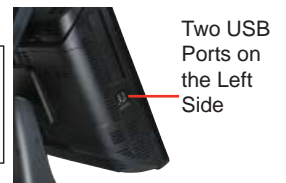
Two USB Ports on the Left Side

All product and company names are trademarks, service marks or registered trademarks of their respective owners. All features and specifications are subject to change without notice.