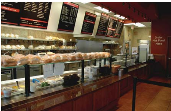
Cafeterias / Delis