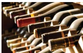
Pizza / Table Service / Quick Service / Liquor Stores